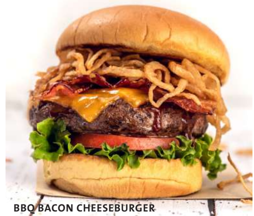
BBQ BACON CHEESEBURGER