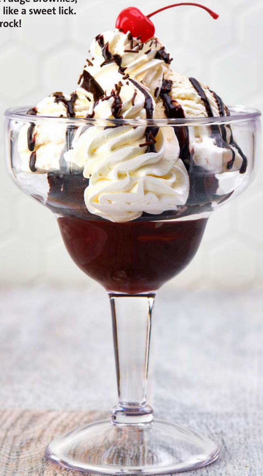
HOT FUDGE BROWNIE

From Milkshakes to Hot Fudge Brownies, nothing says rock n' roll like a sweet lick. Cheers to desserts that rock!