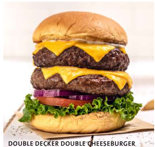
DOUBLE DECKER DOUBLE CHEESEBURGER