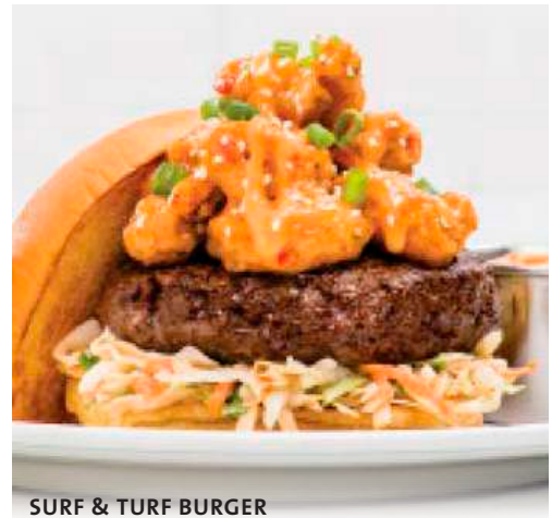
SURF & TURF BURGER

Our signature steak burger topped with One Night in Bangkok Spicy Shrimp™ on a bed of spicy slaw.* €25.95