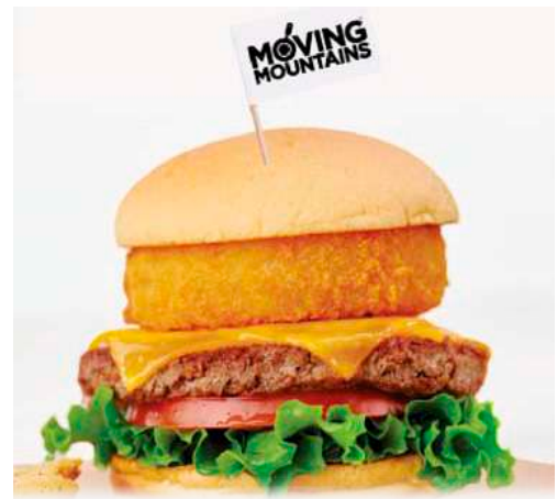
MOVING MOUNTAINS® BURGER