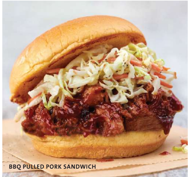
BBQ PULLED PORK SANDWICH

Buttermilk-marinated fried chicken tossed with our classic buffalo sauce with leaf lettuce, vine-ripened tomato and ranch dressing, served on a toasted fresh brioche bun. €19.95