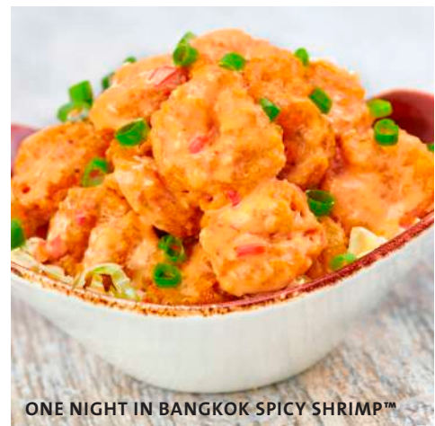
ONE NIGHT IN BANGKOK SPICY SHRIMP™