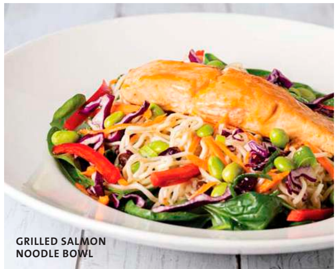
GRILLED SALMON NOODLE BOWL