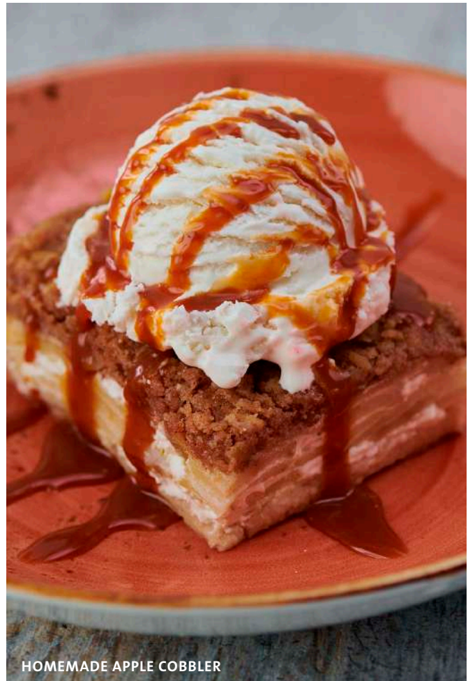
HOMEMADE APPLE COBBLER

Your choice of Madagascar vanilla bean or rich chocolate ice cream blended thick and finished with fresh whipped cream. €8.75