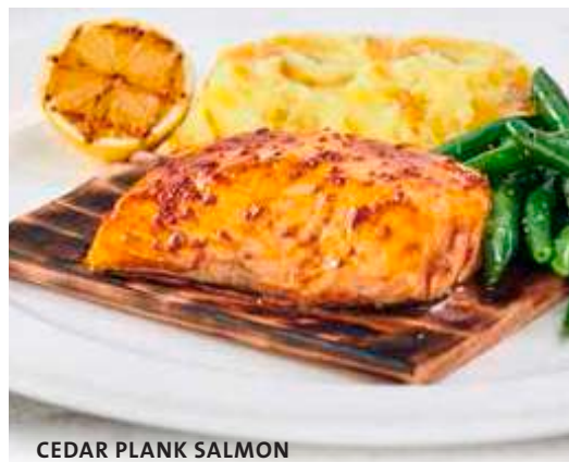
CEDAR PLANK SALMON

Half chicken, brined then basted with our house-made barbecue sauce and roasted until fork-tender. Served with seasoned fries, coleslaw and ranch-style beans.* €25.95